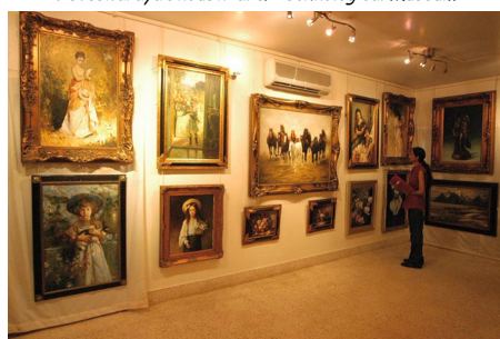
Venkatappa Art Gallery