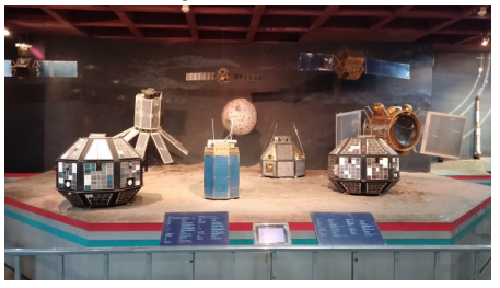
Visveswaraya Industrial & Technological Museum