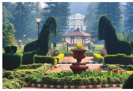
Lalbagh Botanical Gardens