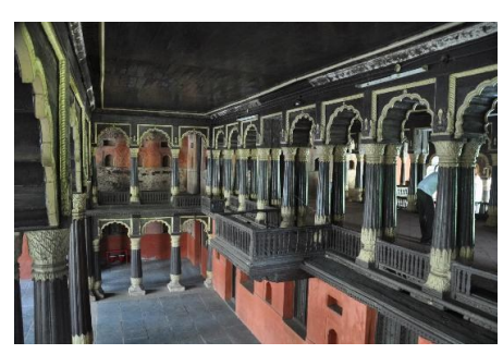
Tipu Sultan's Palace

Bangalore Palace, HAL Heritage Center and Aerospace Museum, Government Museum, Vidhana Soudha, Attara Kacheri, Karnataka Chitrakala Parishath, Water Features Aquarium, Musical Fountain, Ulsoor Lake, Cubbon Park, the Art of Living International Ashram (21 km), Hessaraghatta lake (29 km), Nandi Hills (60 km), Kanva Reservoir (69 km) and Devarayanadurga hill station (70 km) are some of the other major tourist attractions in and around Bengaluru.